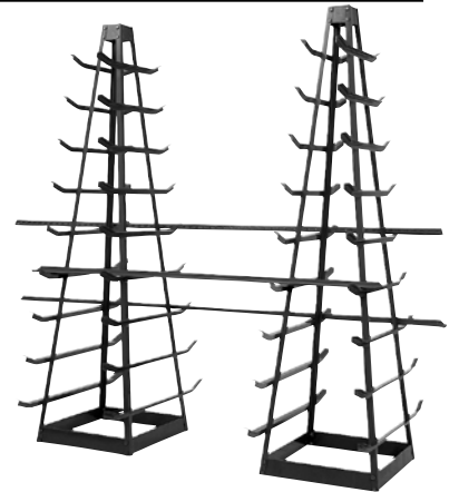
Two 235-SRH1 shown

This unit is 84" high x 22" square at bottom and is tapered to 4 1/2" square at the top. Angled steel arms are spaced every 8 1/2" and extend 8" from uprights. Capacity per pair of arms is 100 lbs. Unit weight is 60 lbs. Finish: Powder Coated Gray